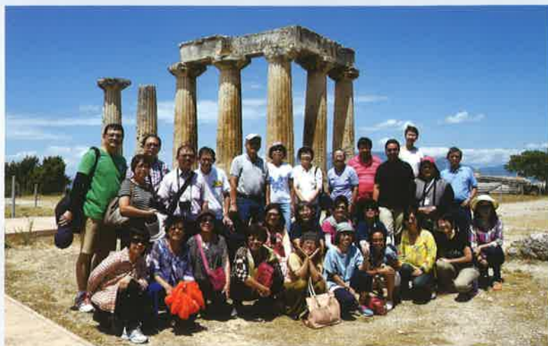
Corinth Archaeological Site - Paul visited Corinth in the 50s AD and later wrote two letters to the Christian Community there. (1 and 2 Corinthians)

the early Church faced and the tremendous courage of the first Christians as well as the religious underpinnings of later Reformation, more importantly, many found rich communion in this journey of faith and took away precious lessons that the Lord had for each.