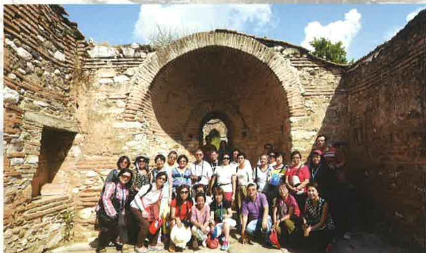
St John's Church in Sardis – The fifth of the seven churches of Revelation (Rev 3:1-6) described as being "dead". It appeared to be alive – had "a reputation of being alive" – looked spiritually vibrant on the outside – but was spiritually lifeless. (Matt 23:27)