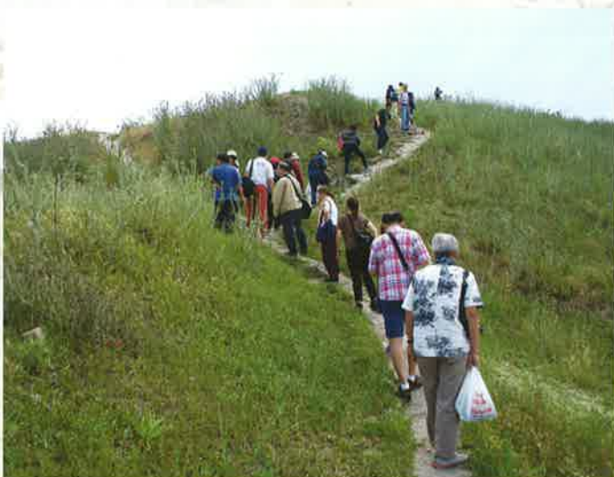
Climbing Colossae Tel – The book of Colossians, addressed to the church there, was believed to have been written by Paul from prison in Rome.

I needed a break from work and it would be more meaningful for it to be a biblical tour. I almost didn't make it because a 2-week leave from