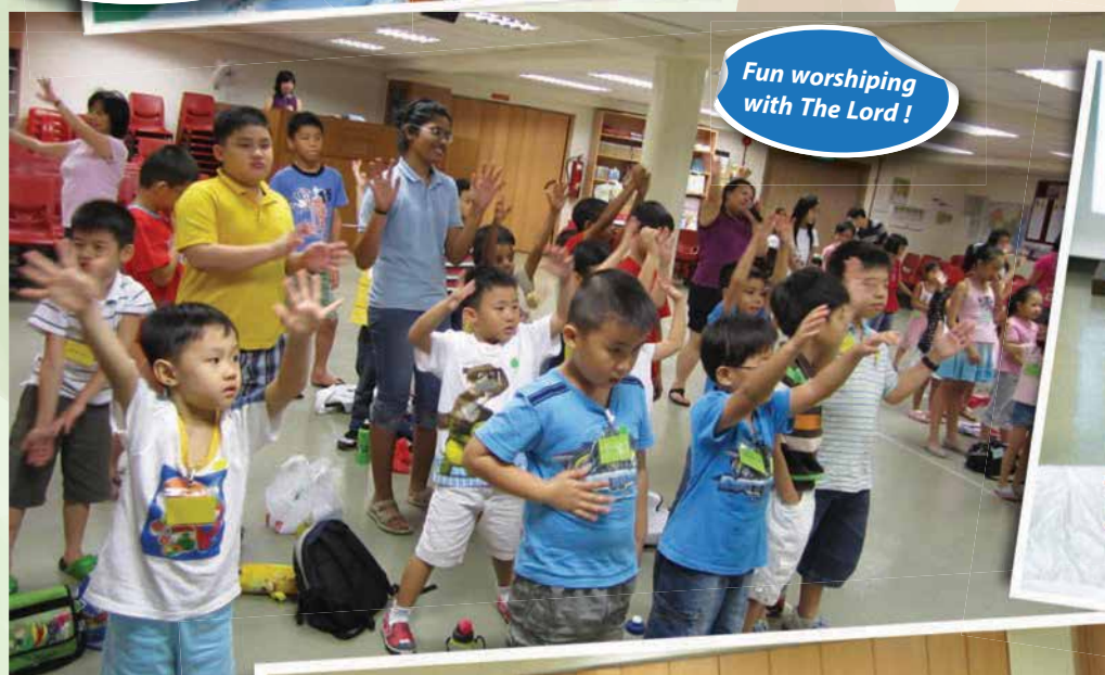
Fun worshipping with The Lord!