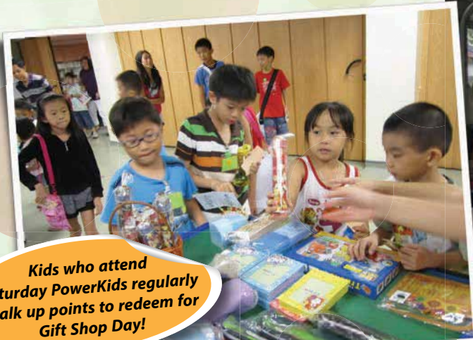
Kids who attend Saturday PowerKids regularly chalk up points to redeem for Gift Shop Day!