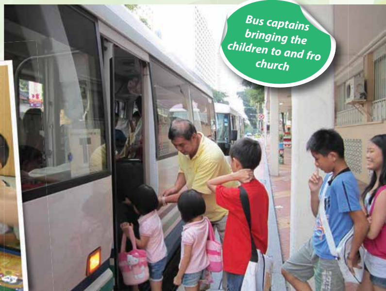
Bus captains bringing the children to and fro church

Thank God for a faithful team of teachers, bus captains and helpers who run the Saturday PowerKids programme once every month to bless the children in Chinatown and beyond.