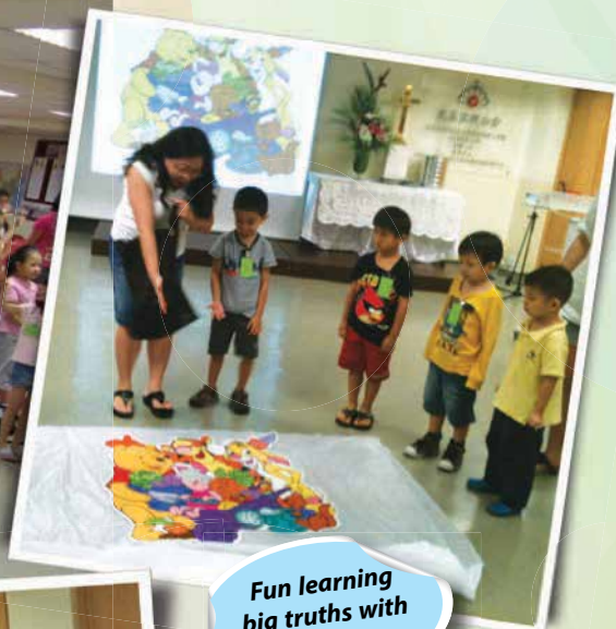
Fun learning big truths with Aunty Audrey