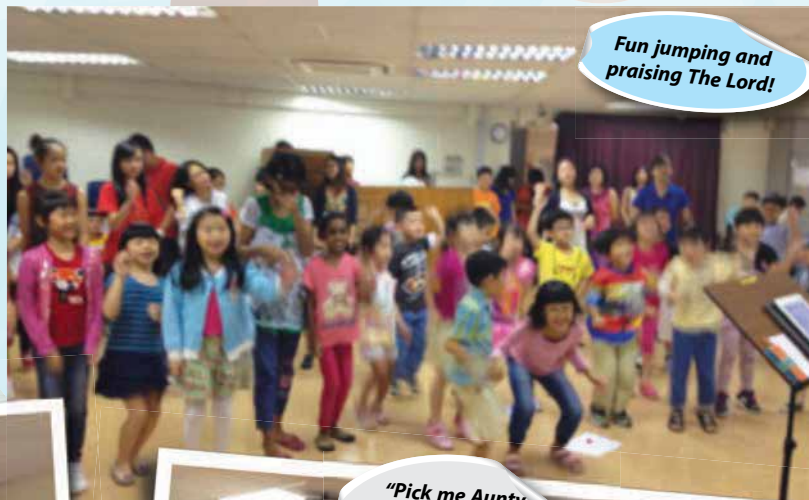
Fun jumping and praising The Lord!